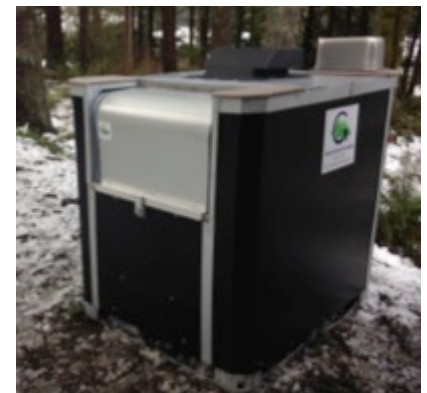
The Earth Cube In-Vessel Composting System