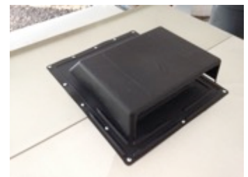
Integrated Roof Biofilter to Filter Odors